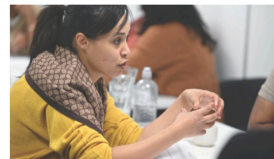
POLICY & NETWORKING

They connect women to organisations that can assist if we cannot. Our main areas of casework are legal, health housing and money support.