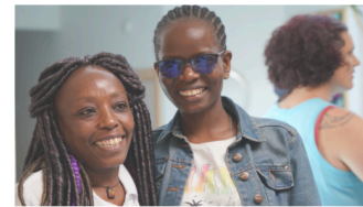
COMMUNITY & GROUPS

We have produced a well-being toolkit and are developing a team of women who will take elements of this to others experiencing the system as well as professionals .