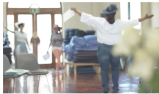
WELLBEING & THERAPY

We have revamped and updated our website - check it out here: www.baobabwomen.co.uk